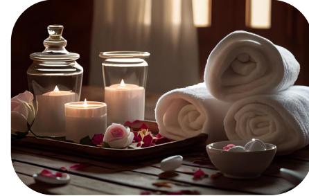
Spa & Wellness