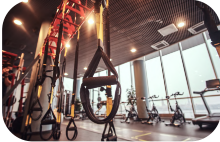
Gym & Fitness Centre

The OASIS GRAND 14 Facing Eiffel Tower & Park