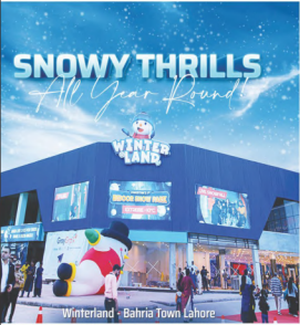
Wintderland - Bahria Town Lahore